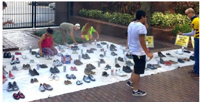
Participants painted shoes white to honor and signify each life lost on Hillsborough County roadways so far in 2018.