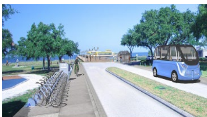
Rendering of a potential shuttle and bicycles for rent in the Cypress Point Park area of Westshore.

Plans for the intersection of Manhattan and Boy Scout Boulevard include new crosswalks and sidewalks.