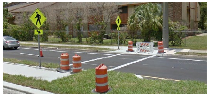
Before and After images showing the safety improvements on Himes Avenue that include a two-staged pedestrian crossing on Himes Avenue, one of multiple newly-installed, high-visibility crossings that help pedestrians cross the street.