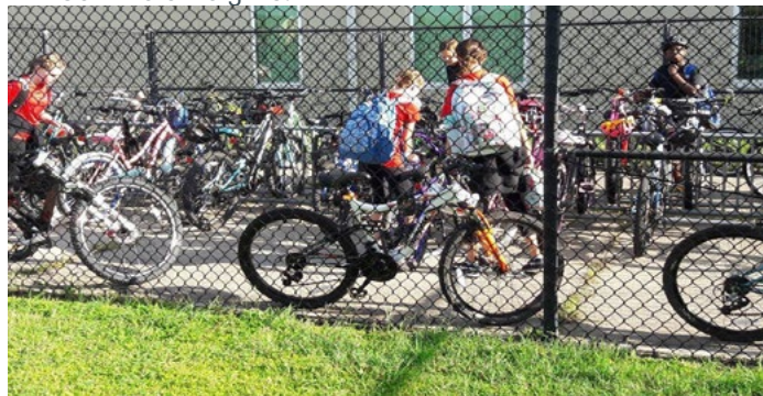
During the Farnell Middle School safety awareness event, the principal noted they are looking to add another bicycle rack due to the large number of bike riders at the school.