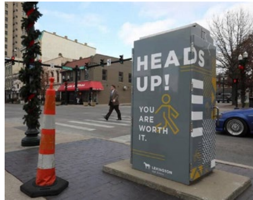
An example of a signal cabinet box promoting pedestrian and bicyclist safety in Lexington, Kentucky.