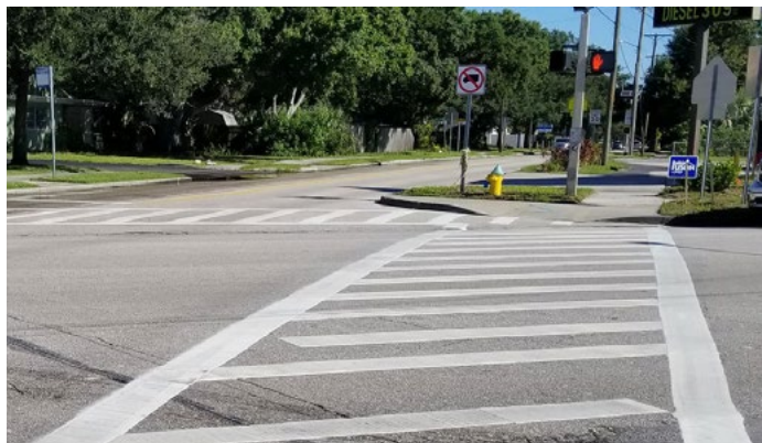
Crosswalk located near Coleman Middle School that has been updated with a fresh coat of paint.

GOAL 2: ESTABLISH A VISION ZERO “CONSISTENT & FAIR” CORRIDOR PROGRAM